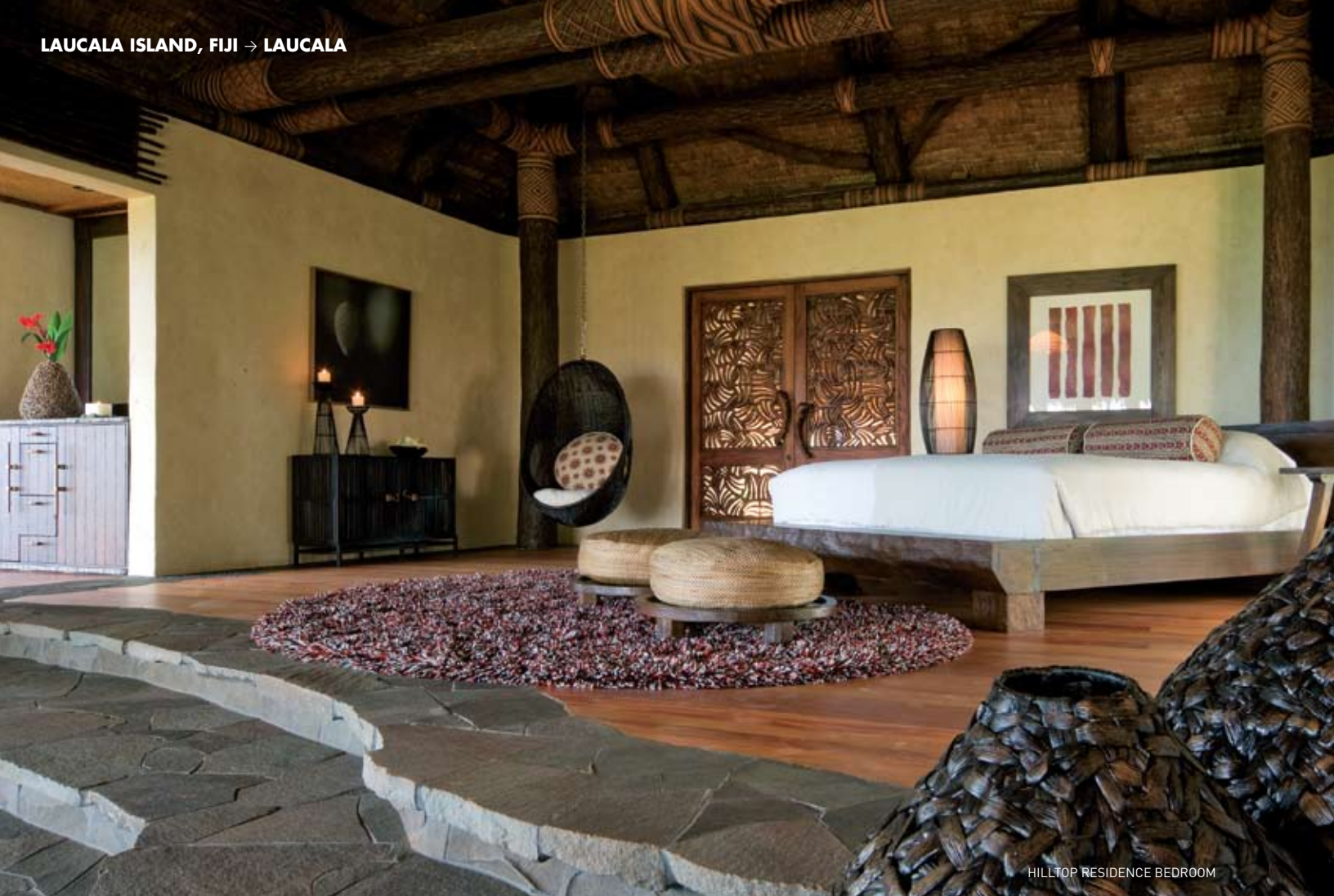
HILLTOP RESIDENCE BEDROOM